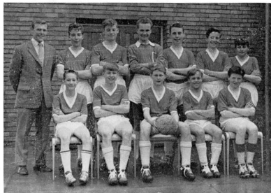
THE SCHOOL UNDER 14 FOOTBALL TEAM