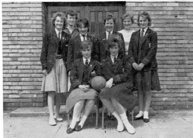
THE SCHOOL NETBALL TEAM