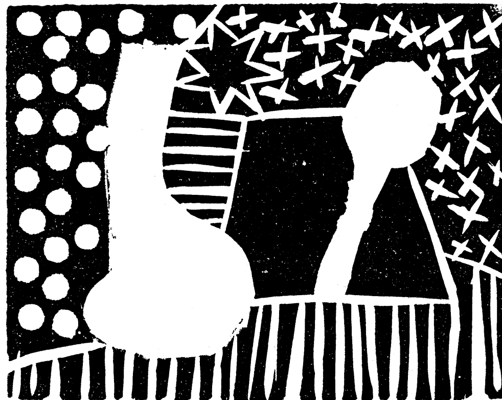
PATTERN, PAT CORNICK, 4L1, A8