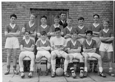
THE SCHOOL UNDER 13 FOOTBALL TEAM

After the schools trials in September, very few School games were played until well into the New Year when the school field had dried out sufficiently. However, the boys' enthusiasm had not been daunted and in a short space of time eighteen school games were played, with Blackwell emerging the winners ten times, seven games being lost and one drawn.